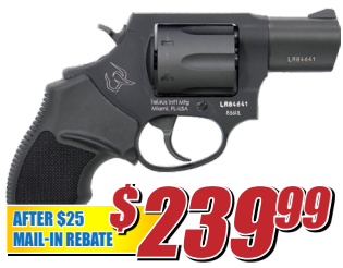
856 ULTRA LITE REVOLVER 38 SPECIAL