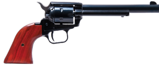
ROUGH RIDER REVOLVER 22 LR