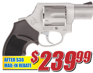
856 ULTRA LITE REVOLVER 38 SPECIAL