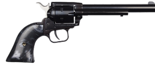
ROUGH RIDER REVOLVER 22 LR