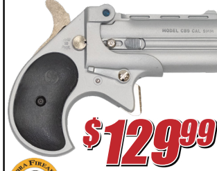
BIG BORE DERRINGER 9 MM