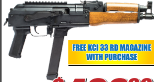
DRACO NAK9 AK-47 PISTOL 9 MM