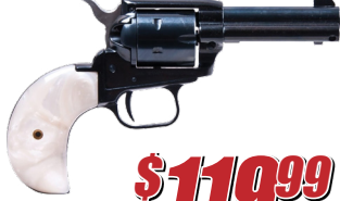
ROUGH RIDER REVOLVER 22 LR & 22 MAG