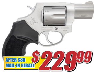
856 ULTRA LITE REVOLVER 38 SPECIAL