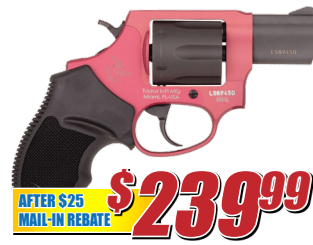
856 ULTRA LITE REVOLVER 38 SPECIAL