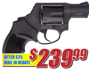
856 ULTRA LITE REVOLVER 38 SPECIAL