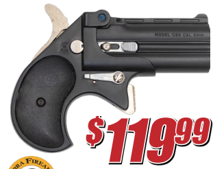
BIG BORE DERRINGER 9 MM