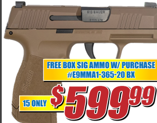
P365 NRA SPECIAL EDITION 9 MM

FREE BOX SIG AMMO W/ PURCHASE #E9MMAT1-365-20 BX