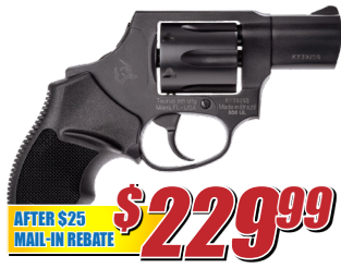
856 REVOLVER 38 SPECIAL