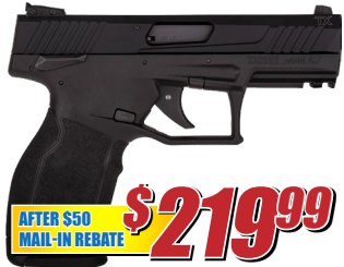
MODEL TX22 RIMFIRE PISTOL 22 LR